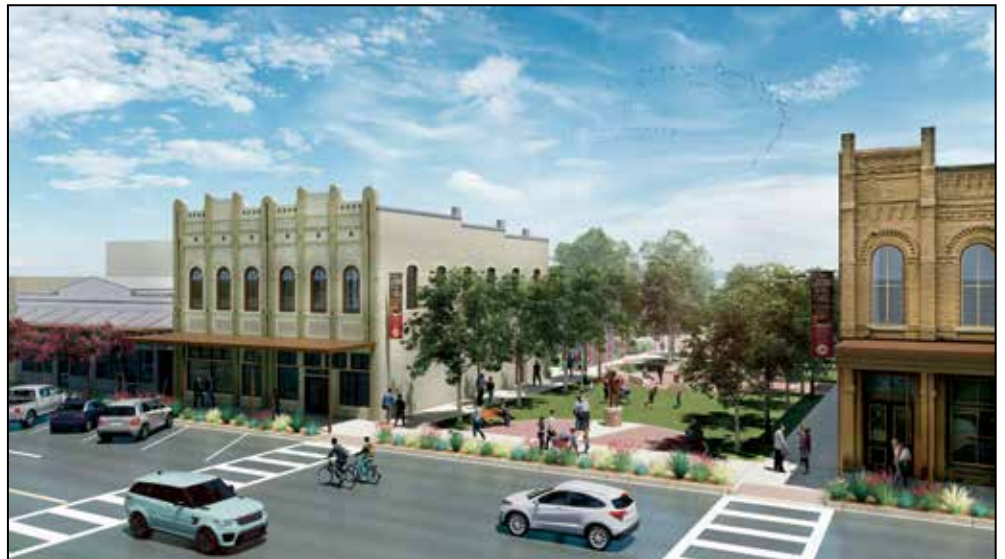
View from Esplanade Street through proposed Pocket Park.

Renderings courtesy Fisher Heck Architects, San Antonio.