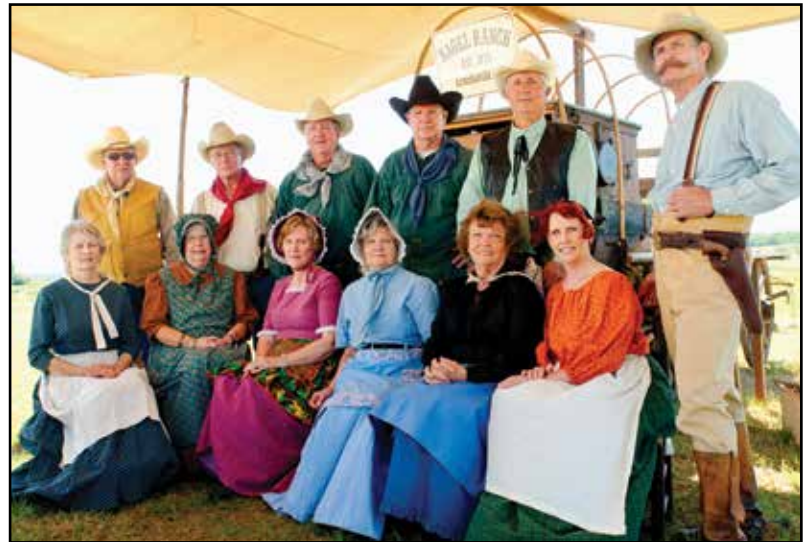
Our signature fundraising event, “Taste of the Trail,” brought out the history buffs in the ranks of our volunteers. Shown here, the Nagel Chuck Wagon team, 2012.