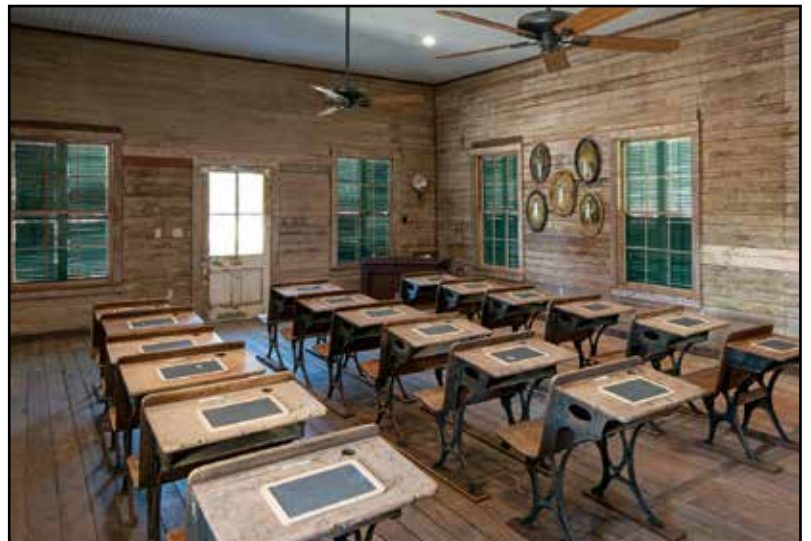
Growing the CTHM campus through preservation: we reclaimed Cuero’s original English-German School (c.1876) to bring class back into session once again.