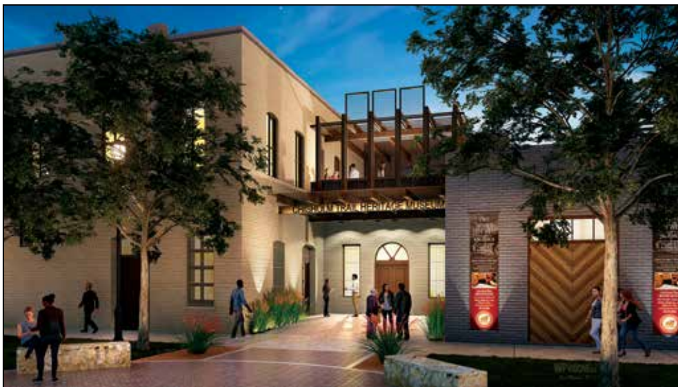
Evening view of Courtyard Entry space, showing the roof deck above.

Shaded rest and recreational areas will be made available for enjoyment by the general public and for special events such as weddings, receptions, small concerts, and other social events and cultural programs.