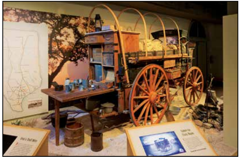
A centerpiece of “Ranching Heritage of the Guadalupe River Valley.” Telling the real story of the cowboy and the Cattle Drive Era, with compelling artifacts and narrative.

Restoration of the school and grounds was completed in 2020 and stands as another successful model of adaptive re-use of an historic structure. The Proctor-Green House is a late Victorian, Queen Anne style home built in 1892. It was generously gifted to Chisholm Trail Heritage Museum in 2018. ★