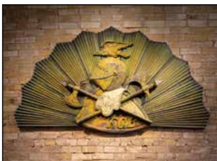
Original Knights of Pythias crest from parapet now housed inside the Museum.

With the name and location firmly established and its mission statement guiding the decision-making process, the following objectives were instituted from the beginning and continue to influence the evolution of the Chisholm Trail Heritage Museum: