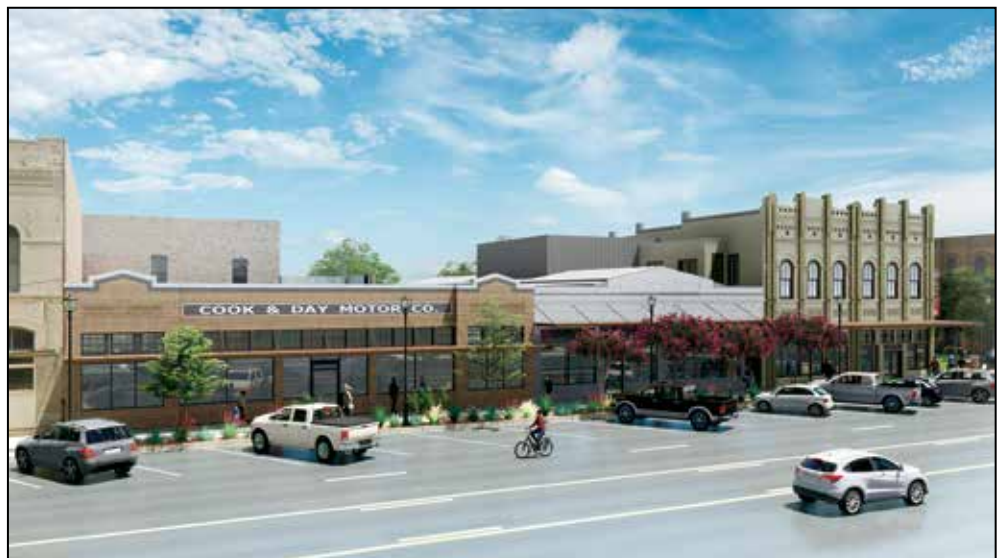
View from Esplanade Street to former Cook & Day and Trautwein buildings.