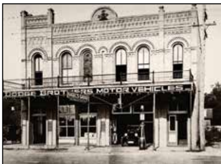
"Before" – Knights of Pythias Hall, with early ground floor automotive dealership.