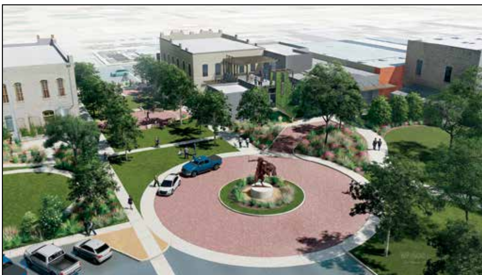
Bird’s-eye perspective of the Roundabout, public art, and adjacent new park spaces.