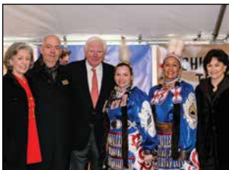
Grand Opening dedication ceremony, November 2013.

In 2002, the Chisholm Trail Heritage Museum's board of directors purchased Cuero's historic (c. 1903) Knights of Pythias Hall and adjacent property located on Cuero's main thoroughfare, with plans to renovate the existing space and add an additional 4,500 square foot annex. By doing so, CTHM would save an abandoned historical structure from further deterioration and contribute to the revitalization of Cuero's historical downtown district.